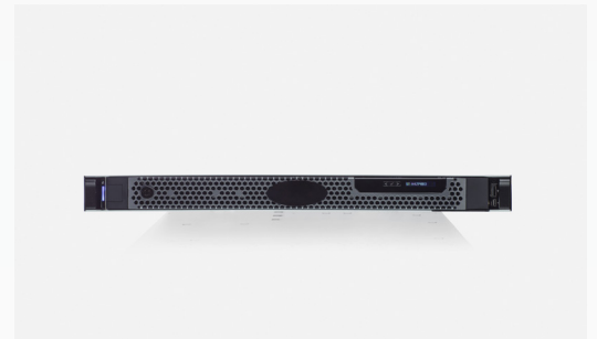
Enterprise Gateway Server