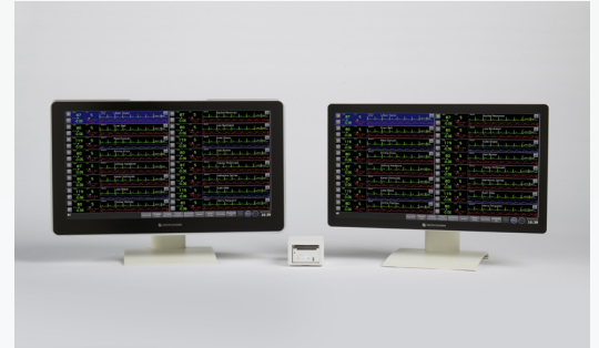
CNS-2101 Central Nurse Station