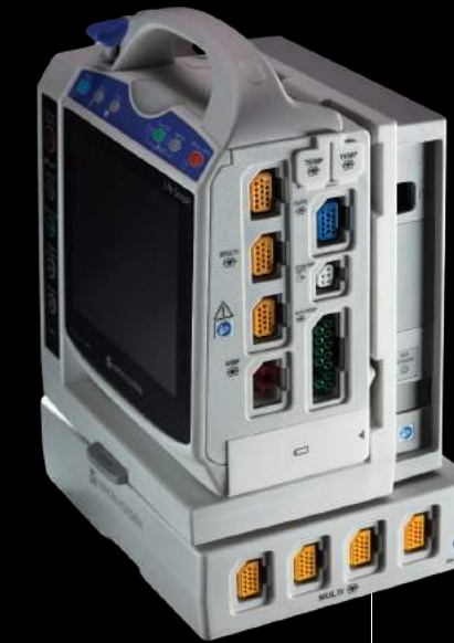
4-port Smart Expansion