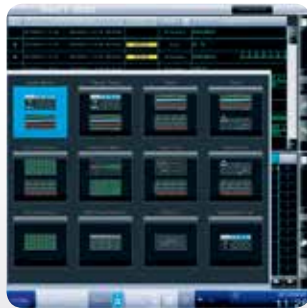
Menu of review screens