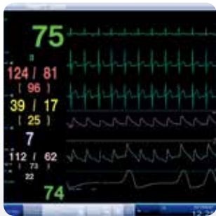
Individual patient review

Clinicians can perform important assessment-related functions: