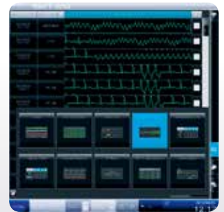
Customization of review screens