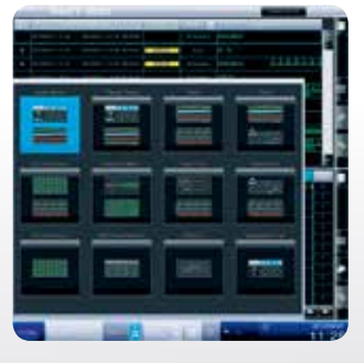
Menu of review screens