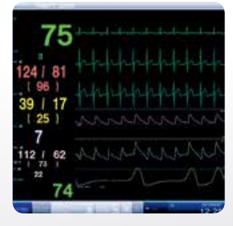
Individual patient review