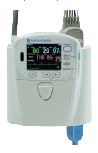
Monitors ECG (3 or 6 lead), respiration, continuous SpO<sub>2</sub>, and NIBP

Battery life: 24 hours with NIBP at 1 hour intervals