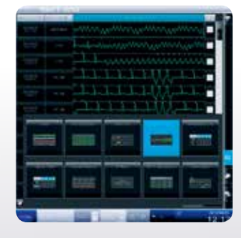
Customization of review screens