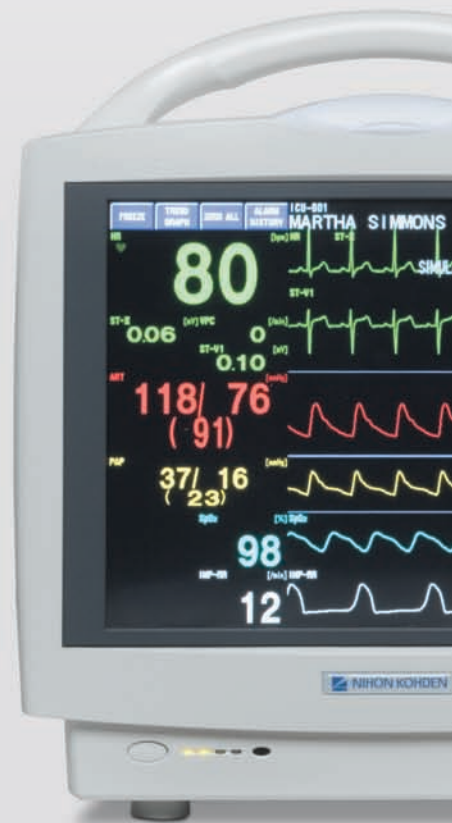
BSM-6501 12.1-inch LCD