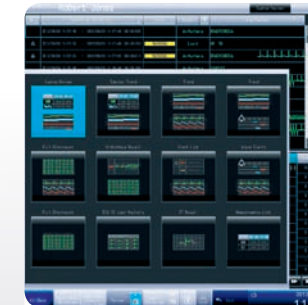
Menu of review screens