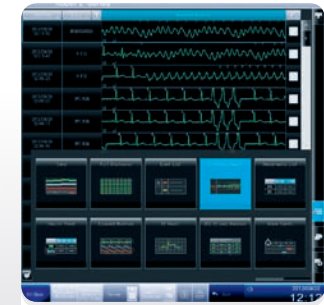
Customization of review screens